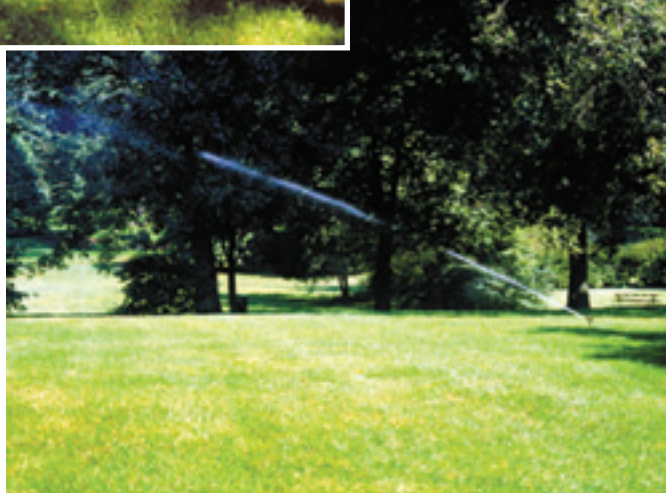
Figure 4. Carpenter ant habitat are those areas abundant in hardwood trees. These areas are typified by older, suburban neighborhoods where large trees are abundant and water rarely limits colony growth and survival.