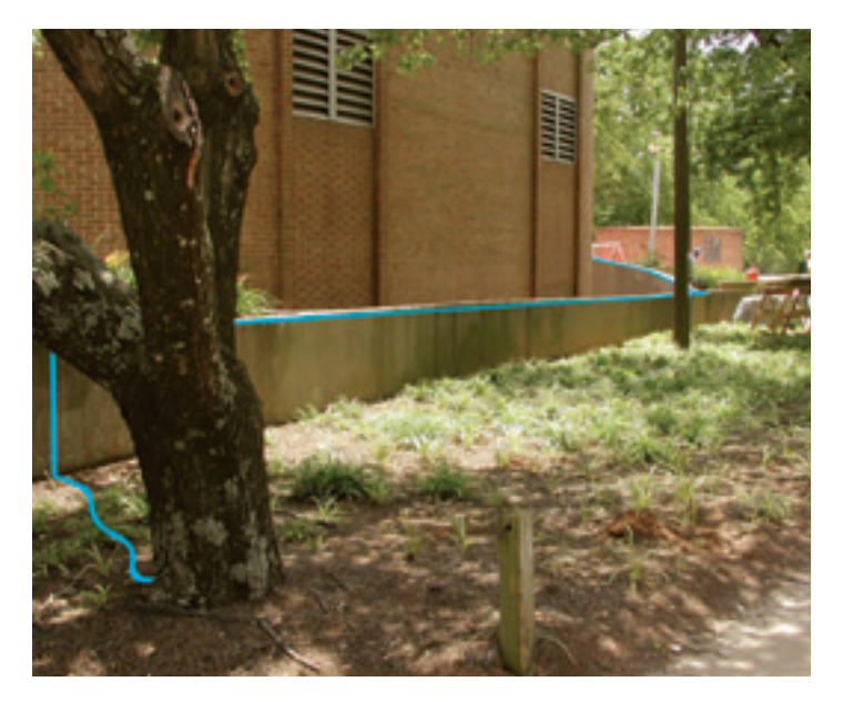
Figure 8. Carpenter ants, like many other ant species, will use existing guidelines such as the edge of this concrete wall (blue line) to forage from nest sites (the tree in this figure) to foraging sites (a garbage can at the end of the blue line).

Outdoors, black carpenter ant nests are found almost exclusively in trees containing treeholes, while the Florida carpenter ant is more opportunistic. It is not only found nesting in trees but also under loose debris found lying on the ground (e.g., roof shingles, cardboard boxes, logs, etc.).