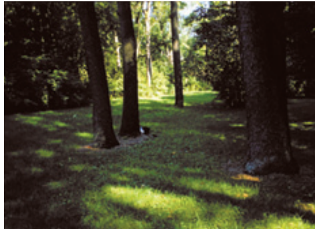
those areas abundant in mature hardwood trees, typified by older, well-established suburban neighborhoods (Figure 4).

BIOLOGY In Georgia, carpenter ants become active in the spring (March/April) and remain active through the early fall (September/October). During the winter, ants become inactive and hibernate in their nest to survive the cold. The habitat where carpenter ants are most common are