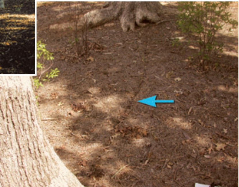
Figure 7. Carpenter ants use well-established, semi-permanent trails (blue arrow) as they move between nest sites and feeding sites, and will even use the same path from one year to the next.

Figure 6. Carpenter ants may travel well over 100 feet from nest sites to feeding sites. In this figure ants could be seen traveling 120 feet along a permanent trail from the tree on the left (yellow arrow) to the tree on the right (red arrow) where they were foraging for food.