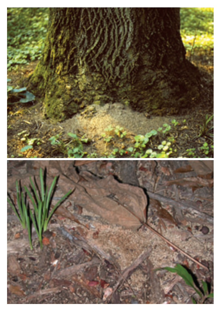
Figure 11. Since carpenter ants do not eat the wood they chew, piles of sawdust-like wood shavings are commonly found at the base of trees where carpenter ants nest.