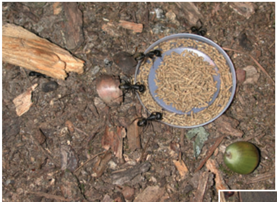
Figure 12. Since carpenter ants rarely deviate from their foraging trail (see Figure 7), baits should be placed next to the trail and as close to the suspected colony location as possible. Baits should be delivered from several points sources and not scattered.