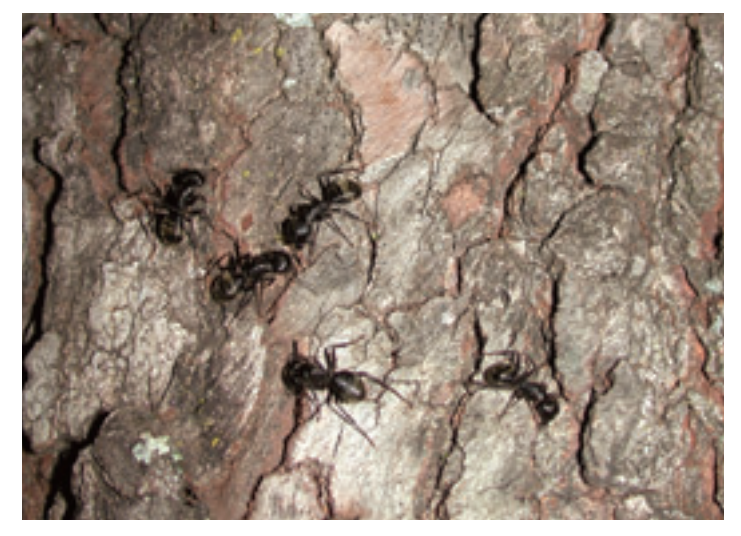
Figure 10. The presence of numerous carpenter ants moving up and down a tree trunk in more or less a single file line is a strong indication of colony presence.

Since carpenter ants use permanent trails, use a flashlight to find ants on the trail and then follow them as they move to and from their nest. Finding just part of the trail can be a tremendous help in finding the nest. After locating several points along a trail a directional pattern will emerge, and often lead directly to the nest. Look for sawdust at the base of trees. Since carpenter ants must excavate wood to expand their galleries, it is common to find piles of sawdust on the ground at the base of a tree where carpenter ants nest (Figure 11). As mentioned previously, carpenter ants do not consume wood but must chew it to build and expand nest galleries. Galleries are created by biting off small pieces of wood and disposing of it to the outside. The small bits of wood often pile up at the base of a tree and take on the appearance of sawdust.