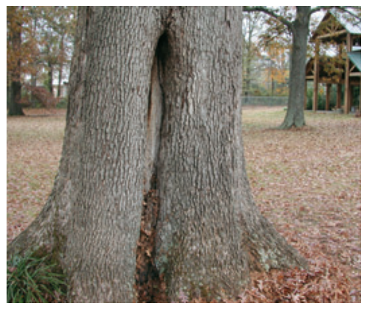
Figure 9. Outdoors, the most common nest site of black carpenter ants is in hardwood trees containing one or more treeholes.

Outdoors, black carpenter ant nests are found almost exclusively in trees containing treeholes, while the Florida carpenter ant is more opportunistic. It is not only found nesting in trees but also under loose debris found lying on the ground (e.g., roof shingles, cardboard boxes, logs, etc.).