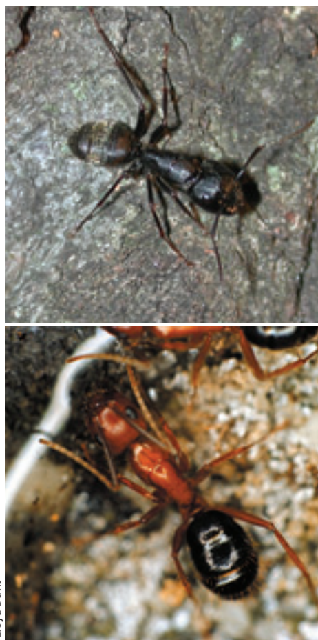
Figure 2. In Georgia, the black carpenter ant (top) is more common than the Florida carpenter ant (bottom).