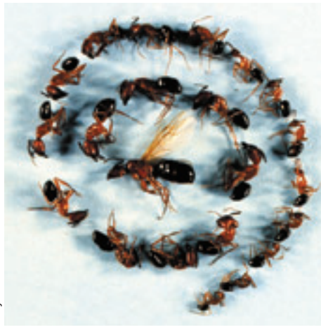
Figure 3. Ants from a single carpenter ant colony vary in size considerably. As such, ant size alone should not be used for identification.

IDENTIFICATION Carpenter ants are the largest of the pest ants found in Georgia. In Georgia, there are two pest species of primary importance, the black carpenter ant ( Camponotus pennsylvanicus ) and the Florida carpenter ant ( Camponotus floridanus ). Black carpenter ants are dull black and their abdomen is covered by yellowish hairs, while the Florida carpenter ant has a deep reddish-colored head and thorax and a shiny black abdomen (Figure 2). Since ants from a single carpenter ant nest vary greatly in size, ant size alone is usually not a good characteristic for identification. Carpenter ants vary in size from about 1/4 to 1/2 inch (Figure 3). To confirm their identity, a few ants should be collected in a small vial filled with a preservative, such as rubbing alcohol, and sent to a Cooperative Extension Service county agent. Look in the white pages under county name for the phone number of the nearest Cooperative Extension Service office.